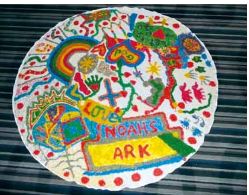
Pathways: vocational: focus. An artistic creation 1 \frac{1}{2} metres wide that provided opportunities for many conversations and comments – even by staff of the retreat venue!