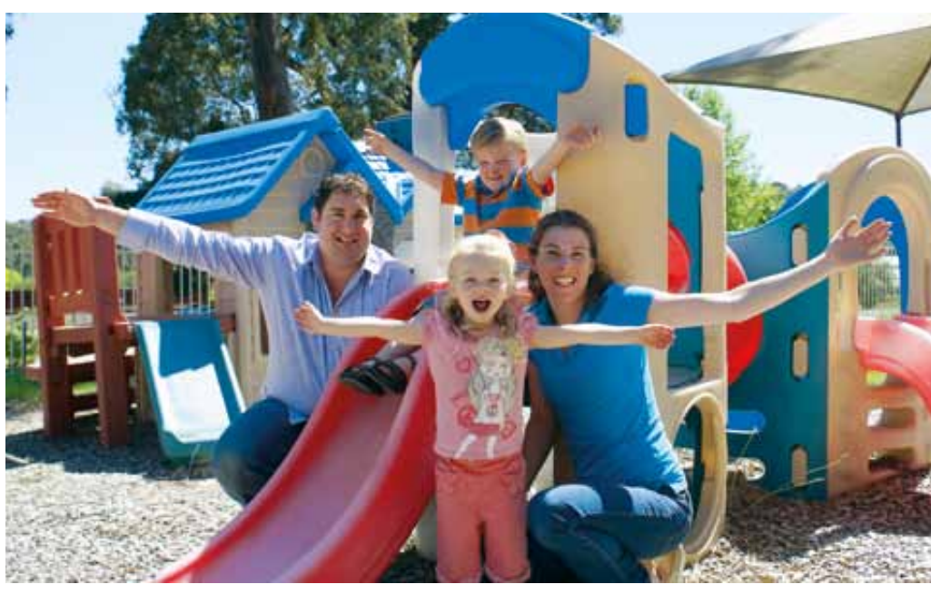
Open Arms Community Child Care Centre, Birdwood

Secondly, the image of children heading into the open arms of a trusted adult, such as running to greet a parent or grandparent, is an image of trust and care. Such an image, backed by loving care, is of critical importance to parents as they leave their 'most treasured possessions', their children, in the care of others. The idea that the staff of the centre will