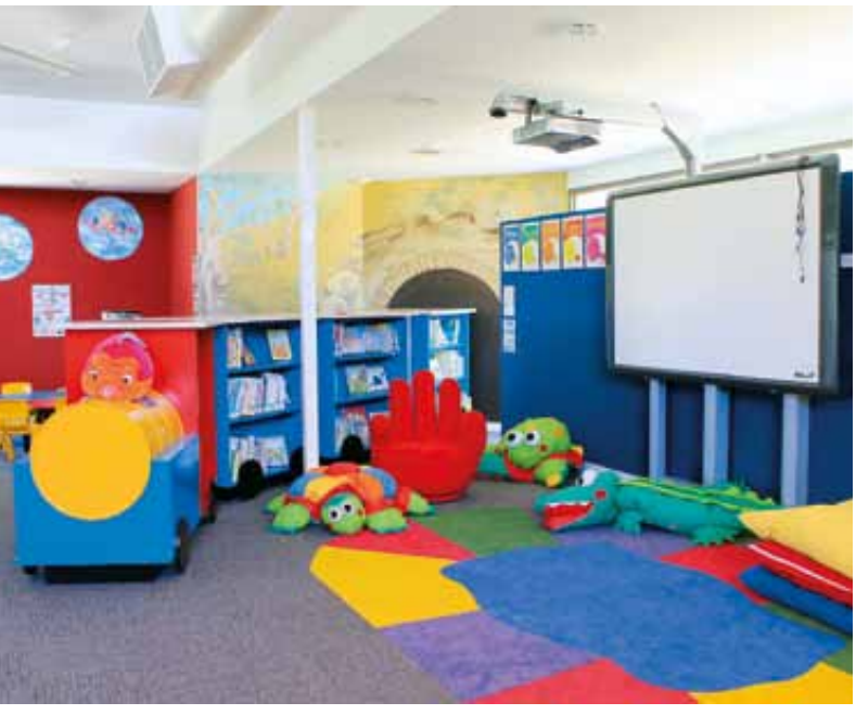
St John's Jindera inviting library

In 2009 staff at Victory Lutheran College in Wodonga recognised the vast opportunities for mission and ministry within the school families.