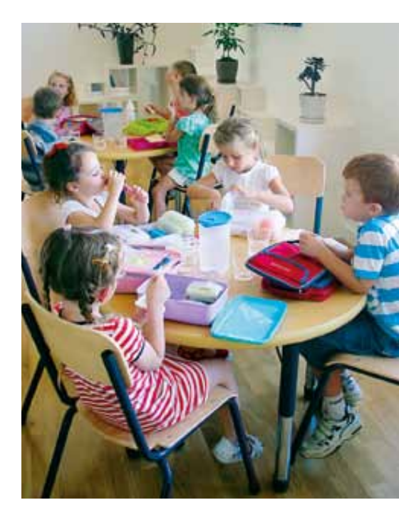
Lunch in the light-filled piazza at Immanuel ELC

ELC Coordinator Immanuel Primary School Novar Gardens SA