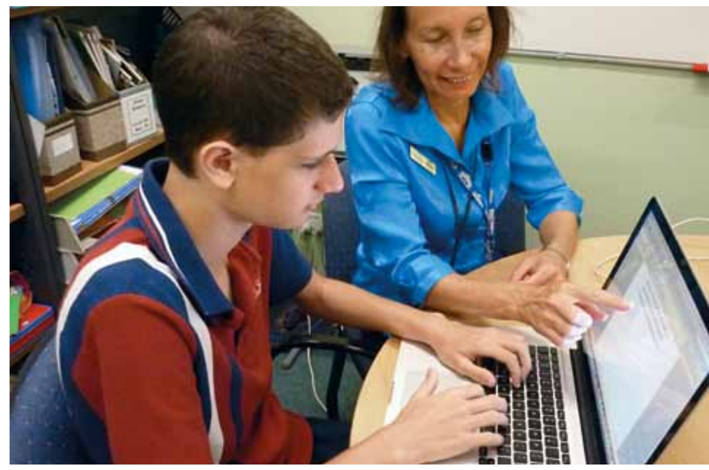
St Stephens Lutheran College – 'every student is special, every student can find a place, and every student can make a difference'