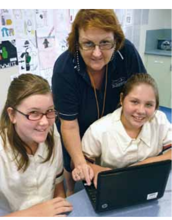
St Stephens Lutheran College – learning support for students has been a key strength

St Stephens Lutheran College Gladstone Qld