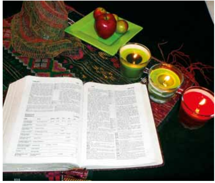
The billum and the Cross: Pathways: vocational focus – an opportunity to recognise that the burdens of our vocations can be named and left at the foot of the cross. (1 Peter 5:7; Psalm 55:22)