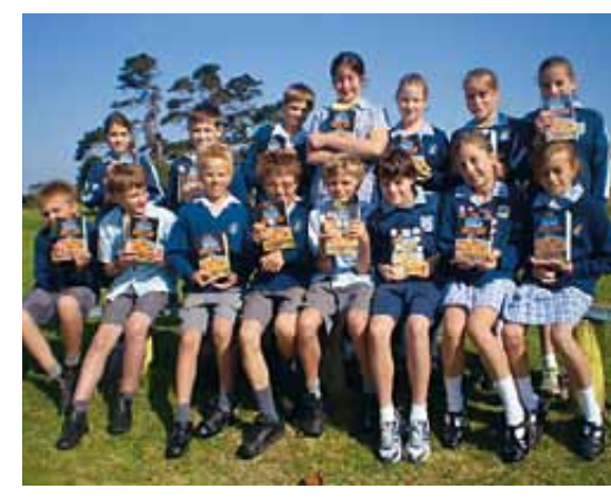
St John's Portland students

In particular, the Equip course really opened my eyes to the fact that as teachers we need to be inclusive – encourage those students whose only interaction with the Bible is in my classroom; try to ensure that all students feel their ideas and questions are valued; show by example that it is what we do and say (rather than Bible texts we can quote verbatim) that is important.