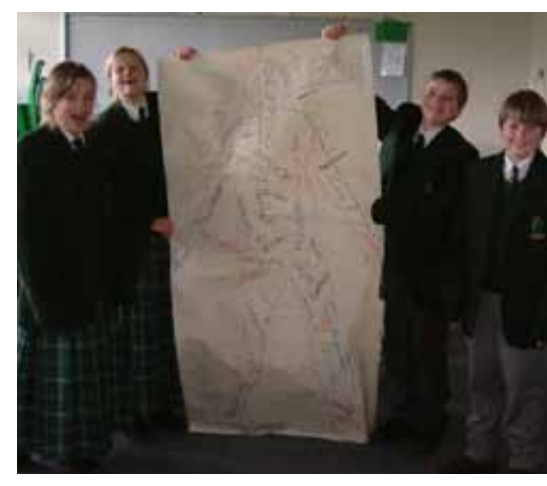
Students doing a 40 Developmental Assets Activity in PCG

Deputy Principal Good Shepherd College Hamilton, Vic