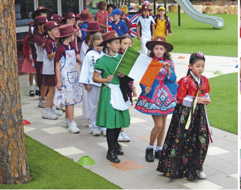
..students, often dressed in national costume, walk with the flags of their countries for the 'Parade of Nations'

Chaplain St Peters Lutheran College Indooroopilly Qld