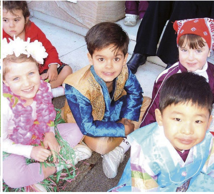
At St Peters we use the term 'multicultural' as our way of describing the fact of our diversity and of God's call to live together in that diversity