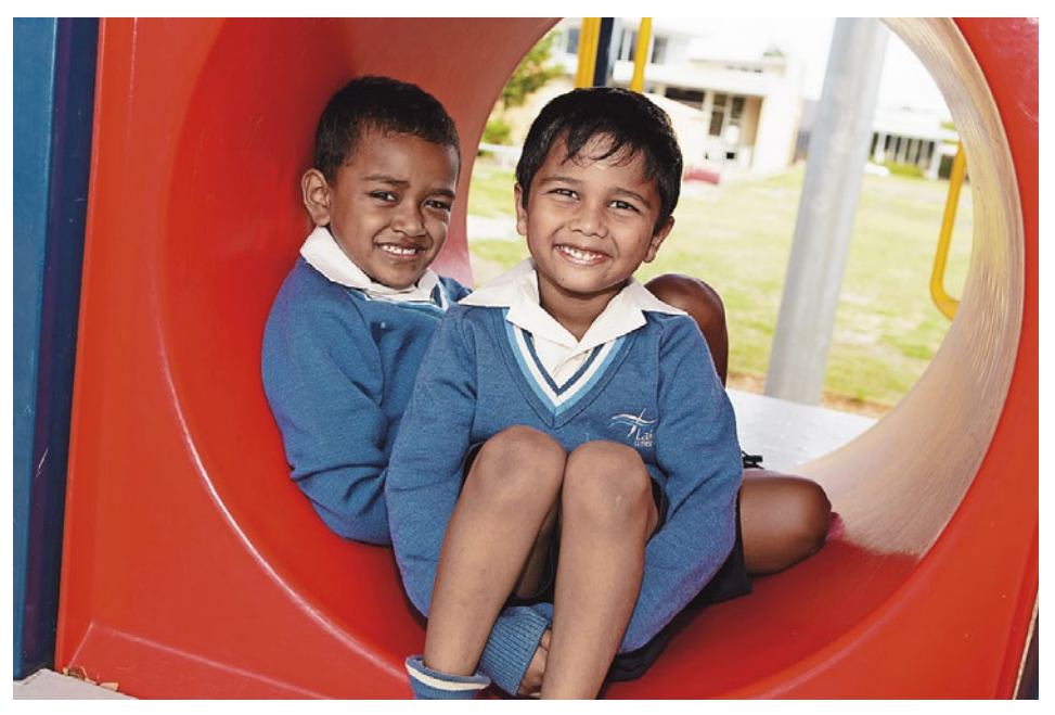
We share a common human agenda about who we are; the meaning of love, life and death among other things

Christianity is not a series of propositional truths but a lived experience. The good news of Jesus is a call to a life of following and a way of being. Lutheran schools are educational