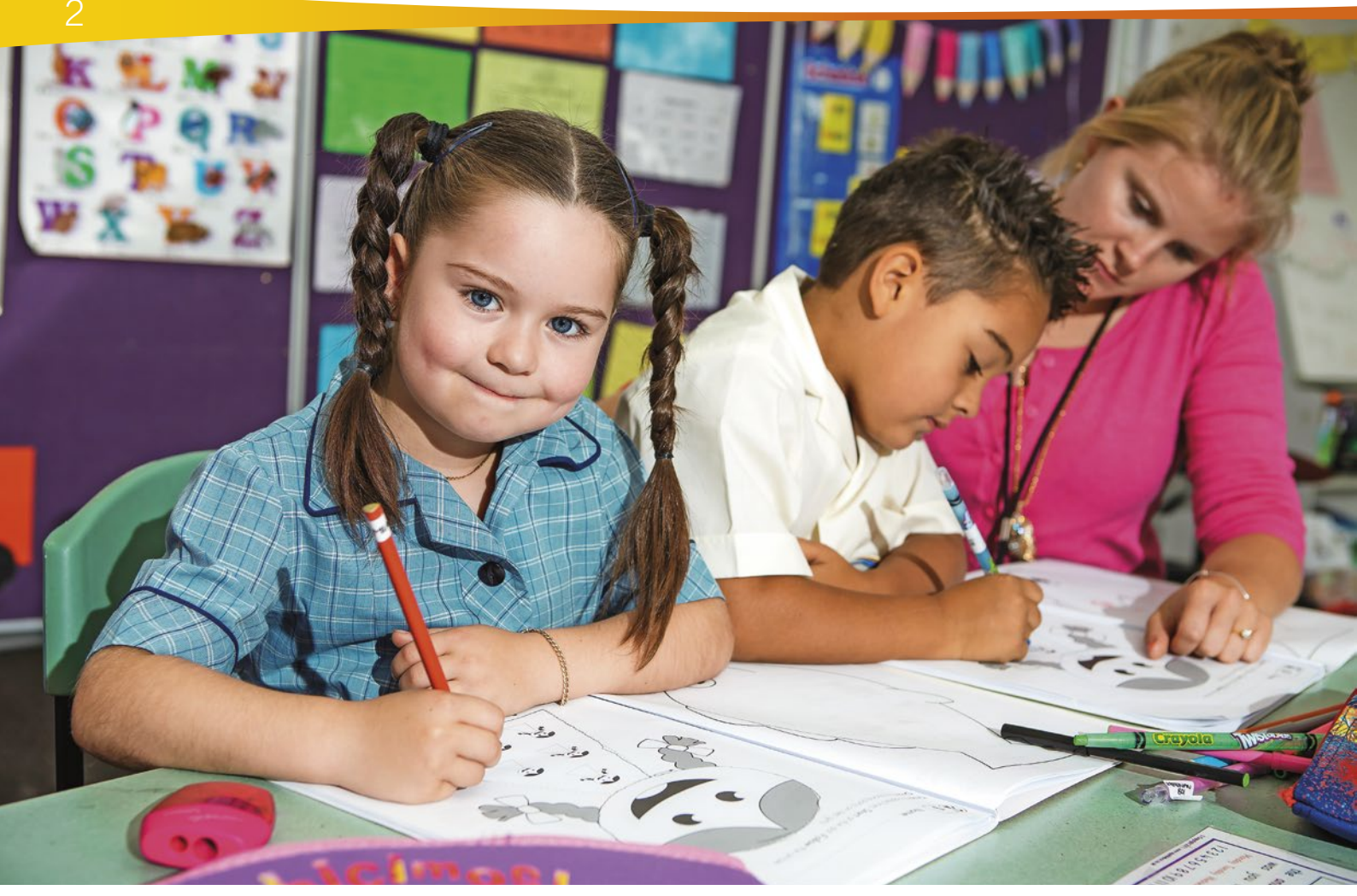
Lutheran schools are educational communities in which the gospel informs all this living and learning

communities in which the gospel informs all this living and learning. Relationships are the currency through which this transaction takes place. Our school communities have a distinctive gospel shaped culture with behaviours, practices, attitudes and symbols that reflect God's love in authentic, tangible ways. We welcome our students, staff and families into an experience of the gospel in community that is transformative. It is an