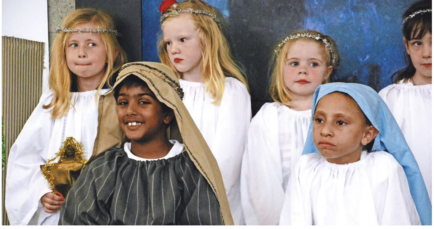
Can a Hindu play the part of Joseph in the Christmas nativity play?

Principal St Peters Lutheran College Springfield, QLD