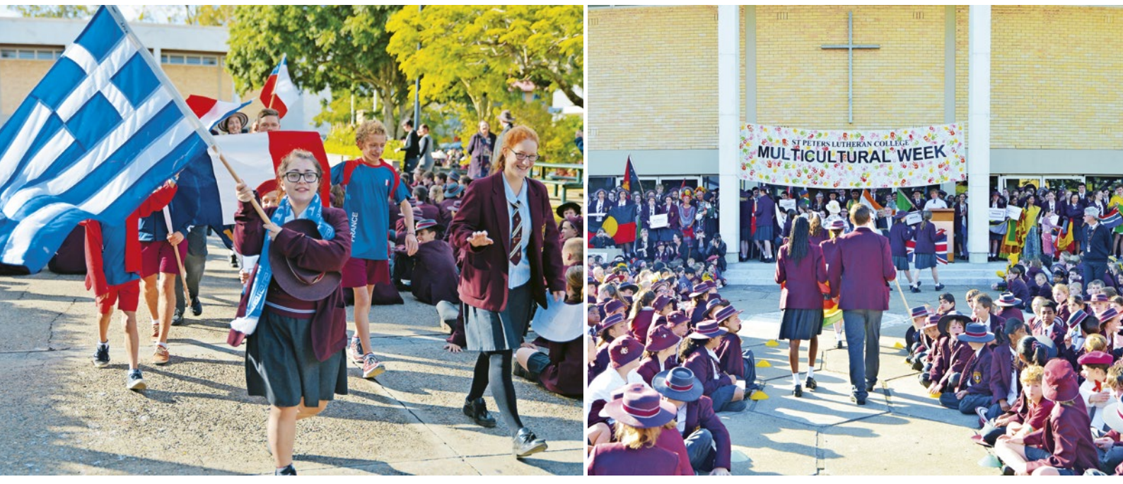
'I don't think many of my class realised where I was from until I walked with my flag, and it's given me the chance to talk about why my family moved to Australia'

The whole ceremony is framed in a Christian service, with the Pentecost story from the book of Acts retold and the Lord's Prayer spoken in over 15 different languages by native speakers. The message of the ceremony is that God has called us into a rich and diverse community, a community of people whom he loves and calls into community with him.