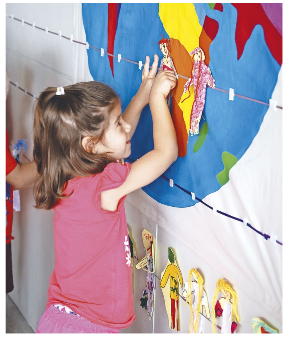
Providing effective ministry to our students across cultures is not complicated on the one hand, but on the other hand, it does not happen automatically

If the Lutheran school exists solely to nurture the faith of students raised in the Lutheran church, then this limits its mission significantly.