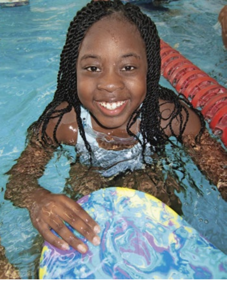
We enable our EAL learners to experience success across the curriculum