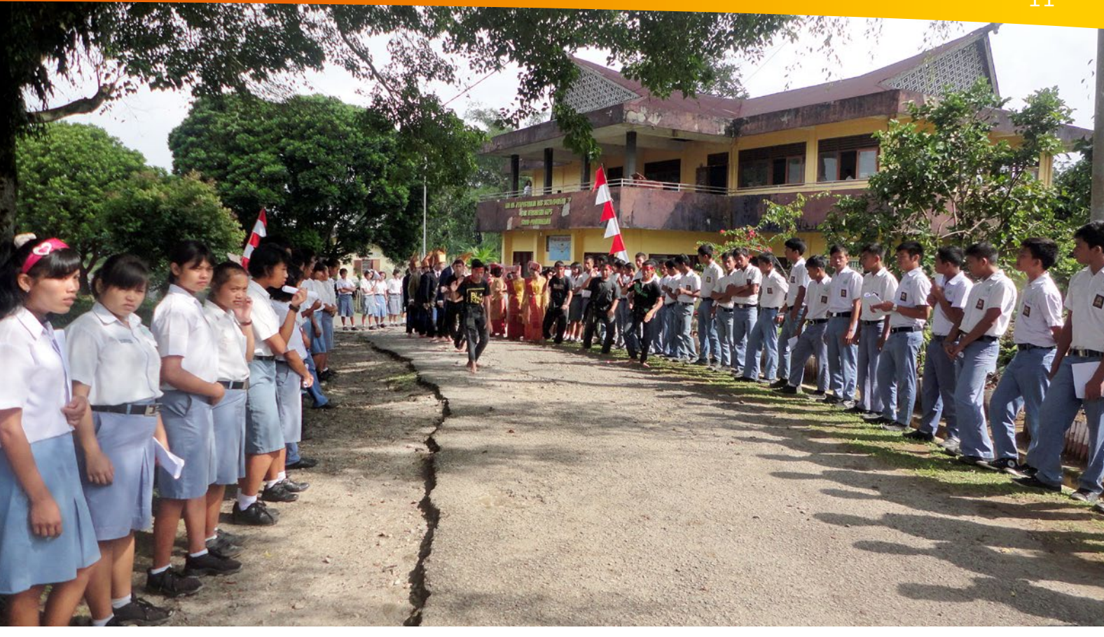
Students from SMA GKPS making a line of honour

students but it was also a time to feel blessed that we had become a part of it.