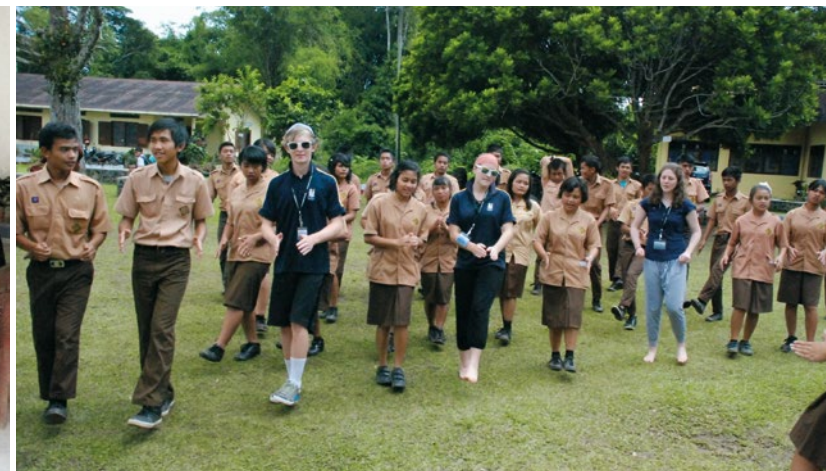
Learning traditional cultural dance