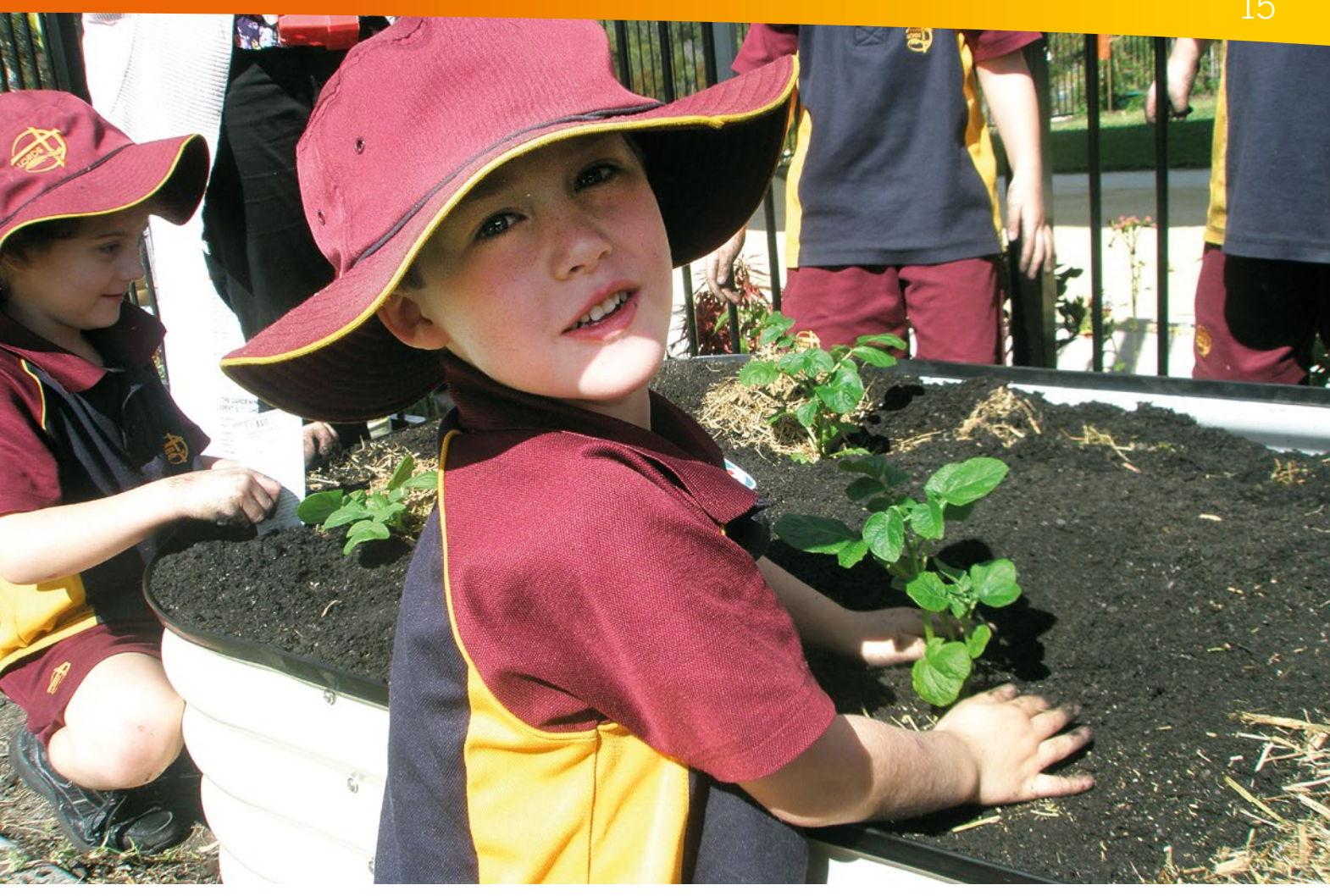
Growing together side by side...