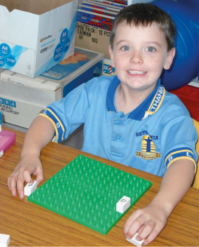
Our students are supported by a vast array of learning enrichment approaches