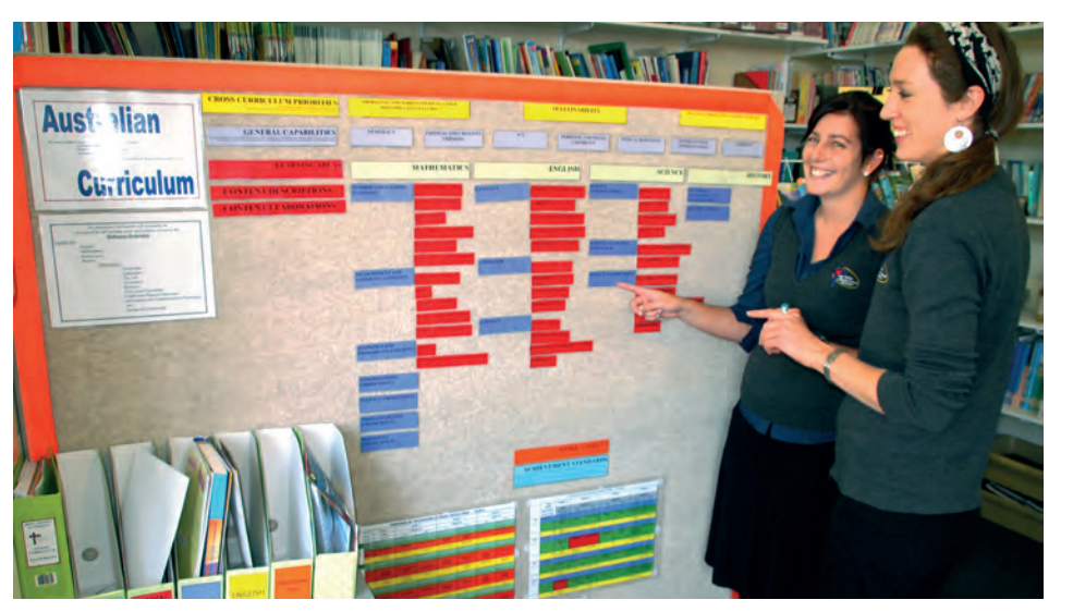
Charting progress at Holy Trinity Lutheran School Horsham

Following an audit of curriculum mapped to the Australian Curriculum, our Phase