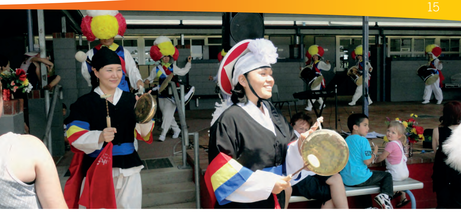
Engaging with Asia at Plainland

also used to enhance student learning. In this instance, our college successfully applied for the national Becoming Asia Literate: Grants for Schools initiative, which allowed our college to fund a number of professional learning opportunities for our teachers: guest speakers at staff meetings, attendance at numerous cultural activities/events, facilitating school based and community groups to broaden teachers' intercultural understanding of Asia and Australia's engagement with Asia.