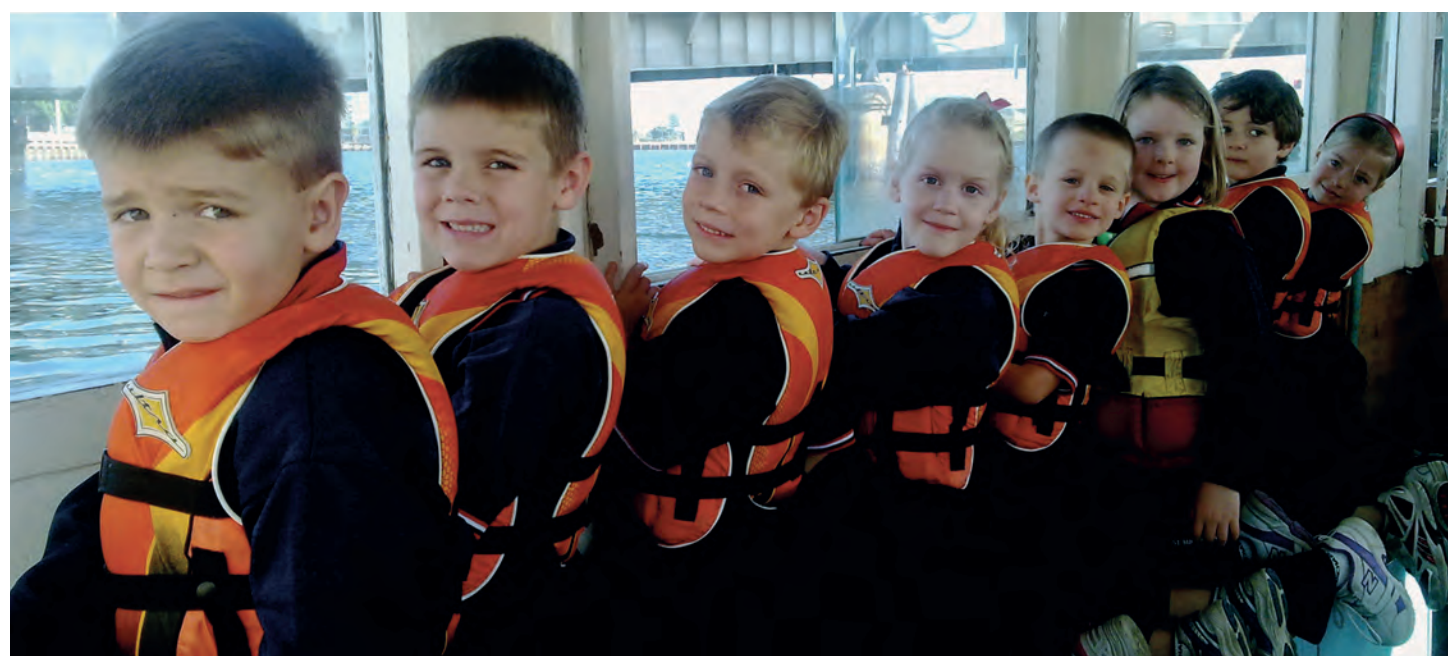
Year 1 students from St Michael's checking out transport systems at Port Adelaide

Deputy Principal/PYP Coordinator St. Michael's Lutheran School, Hahndorf