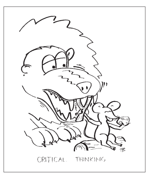
A visual representation of the attribute!