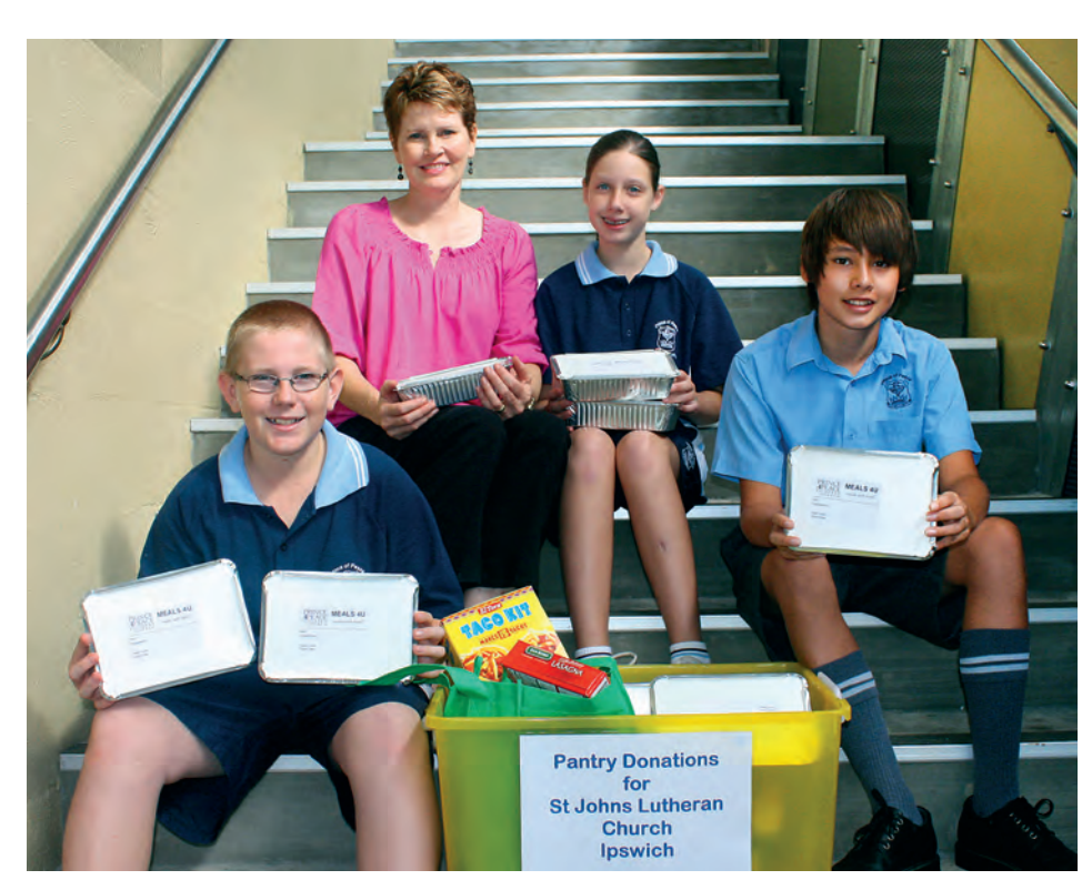
Prince of Peace school and congregation supporting the flood victims

well as children of the congregation have