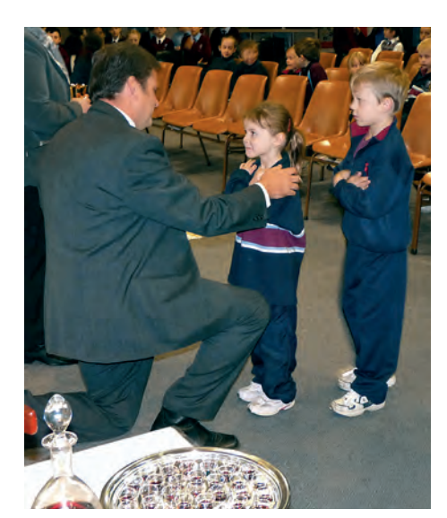
Friday chapel... pitched at primary school aged children

Worship Coordinator Golden Grove Lutheran Primary School, Golden Grove SA