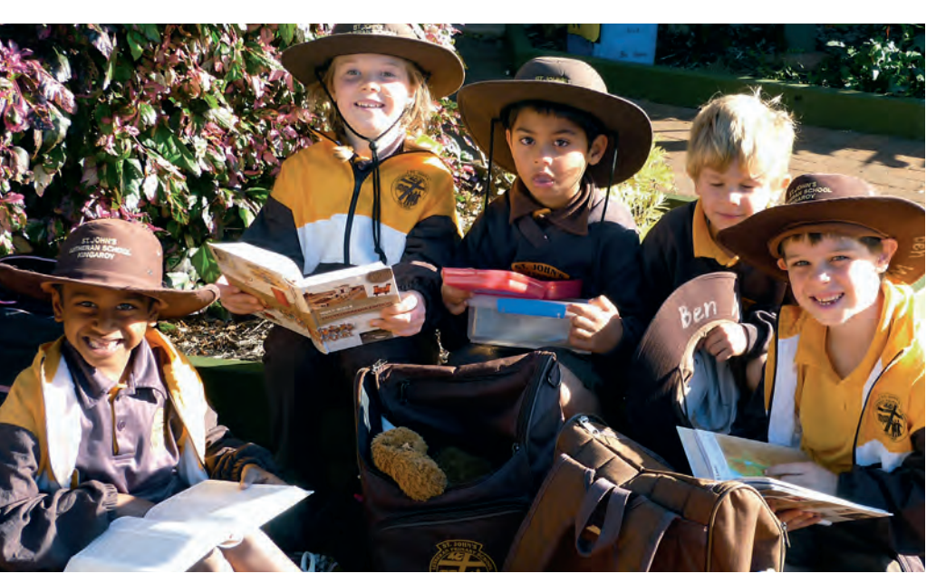
Year 2 St John's students reading their Bibles before school