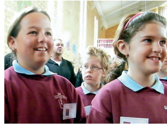
The children are involved