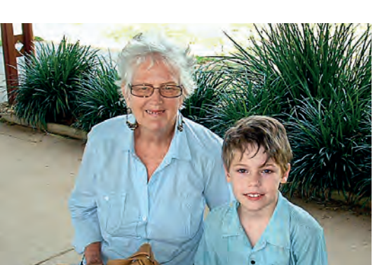
with me. I like it because she is really nice."