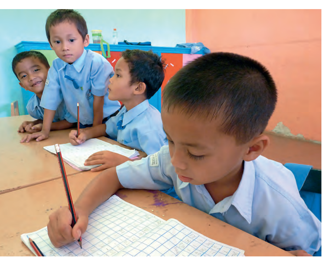
Junior school students from SMA YP HKBP School, Pematang Siantar

The LEA vision is that through increased LCA interagency cooperation coupled with succinct and user-friendly guidelines schools will feel confident to venture into this aspect of service learning, which can deeply enrich a school community.