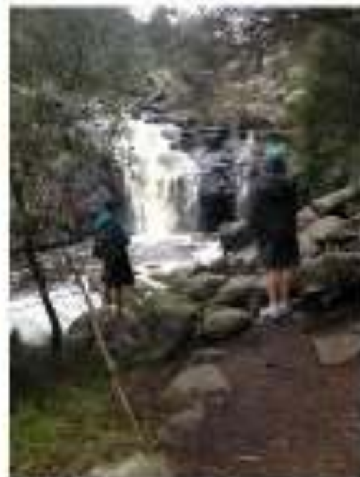
Deep Creek Waterfall (Nigel Currie)