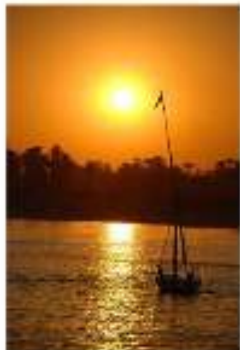
Sunset, Napa Valley (WE: Mead)