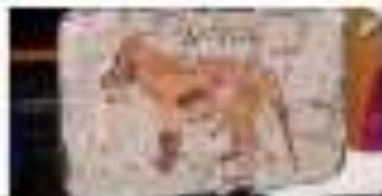
Student work at the Environmental Center