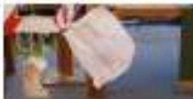
SMER & myzic staff