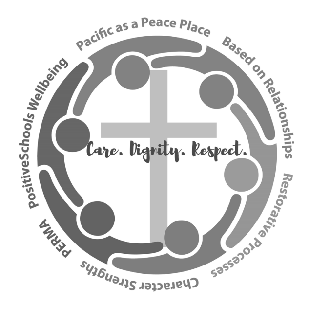
Figure 1: Student-created visual