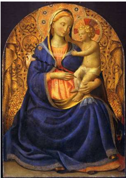
Fra Angelico: The Virgin of Humility https://en.wikipedia.org/wiki/Madonna_of_Humility_(Fra_Angelico)

Compare this image with the three that follow: