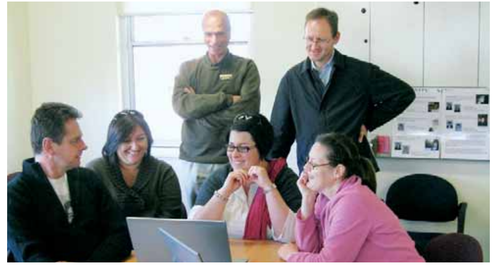
Unity staff during the ICT adventure day

Head of Digital Education Unity College Murray Bridge, SA