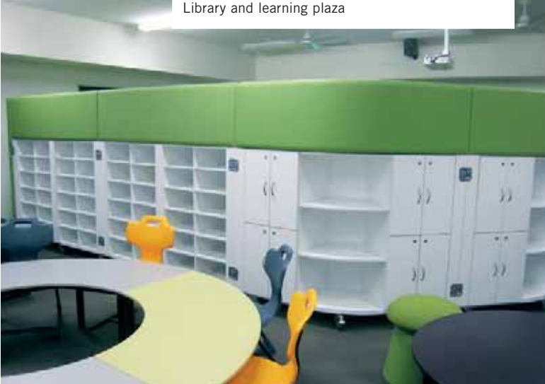
A shift in thinking