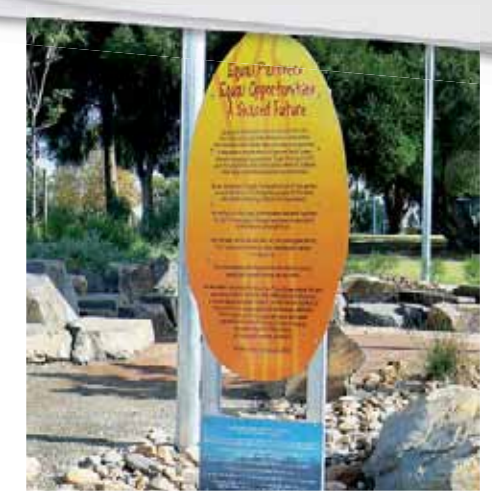
Redeemer's Indigenous Garden (all above images)

We will show respect to our local heritage by learning more about Indigenous people and culture, and sharing this with others who visit our garden.