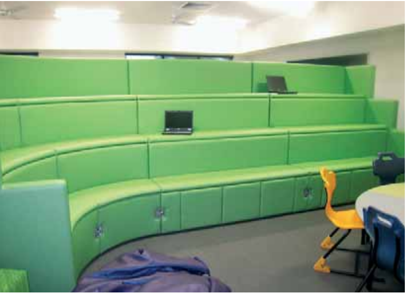
The result of a dream