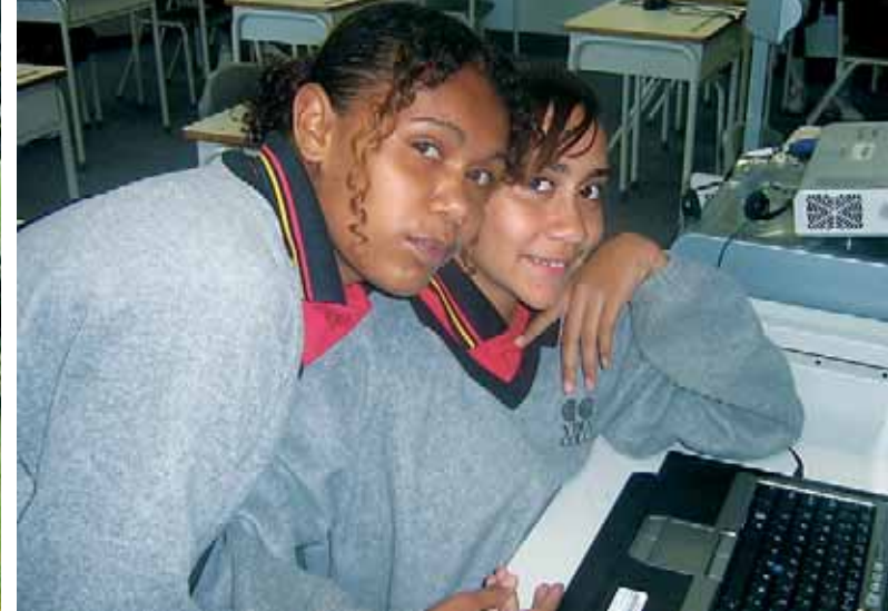
Several classes utilise personal laptops