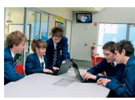
Concordia students working wirelessly