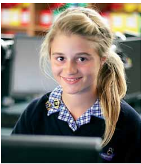
...we continue to explore how we can more effectively make use of the technology that is available