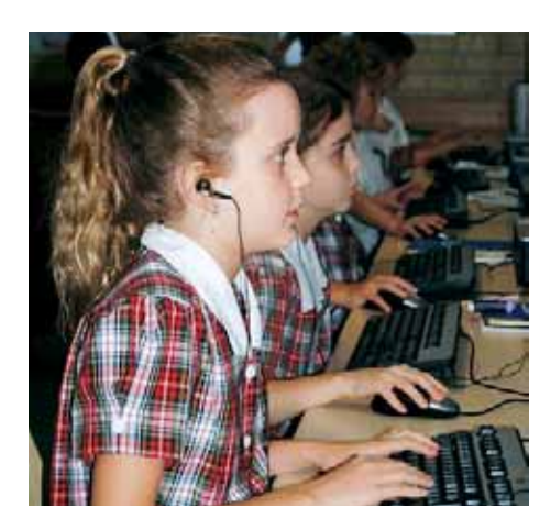
Search, ask, learn, connect