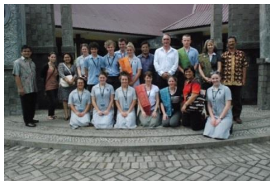
Students of Navigator College, Indonesian school partnership

There are a range of opportunities for schools to partner with and serve in Indonesian Lutheran churches and schools.