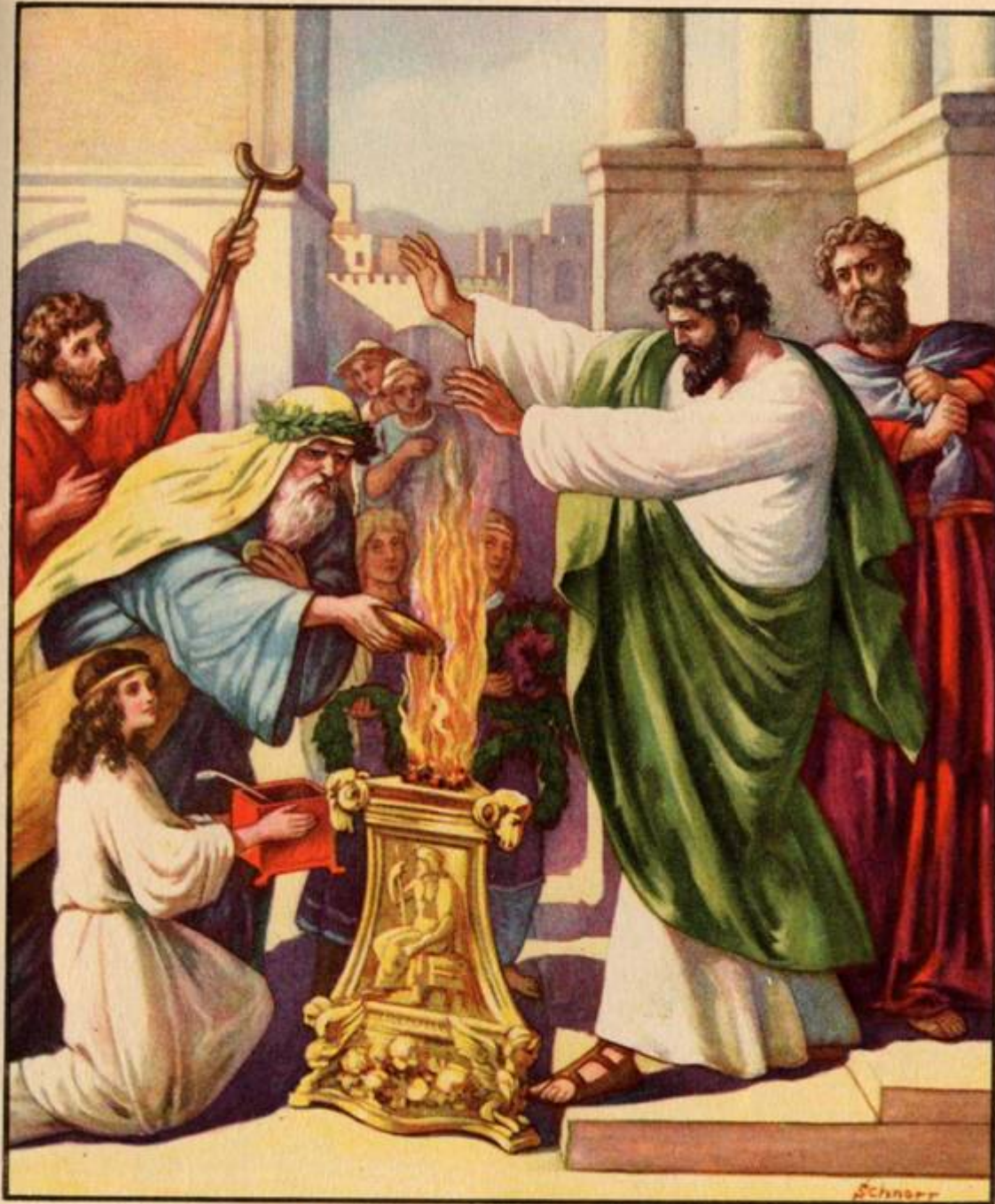
PAUL CURES A LAME MAN AT LYSTRA